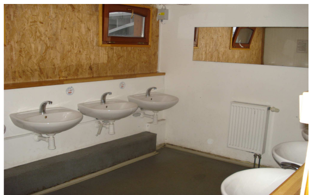
Illustration 4: The lavatory