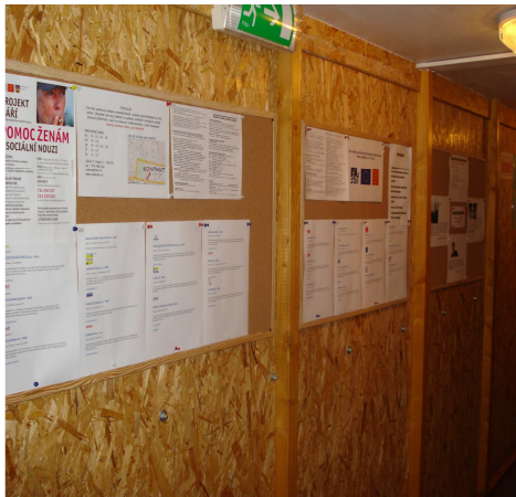
Illustration 1: notice board for finding a job

On my visit on the boat I discovered that the interior of the boat is well build and very clean, no wonder, the ship is beeing cleaned every day after the homeless people leave. The rules are very strict because the one of the main goals of the ship is to push the people to find a job and to returne to normal life again. Thats why the crew of the ship offers consultant service.