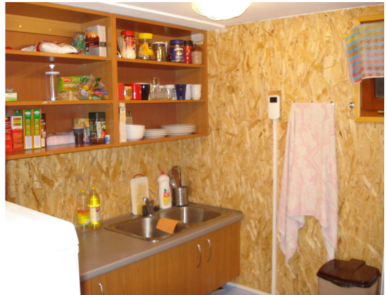
Illustration 2: The kitchen